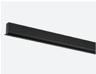
Magnetic Track Profile Recessed with Flange

NOTE: Straight Magnetic Track Profile sold separately.