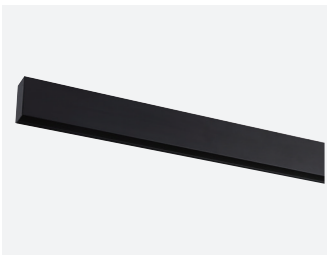
Magnetic Track Profile